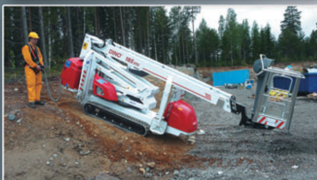
Excellent gradeability 43 %.