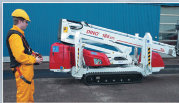
User-friendly radio control.