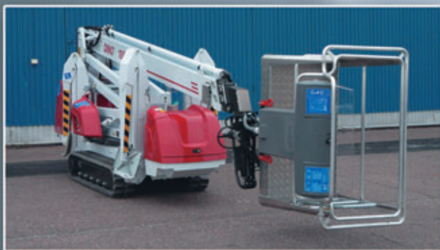
Compact and narrow, 1.15 m, without removing the basket.