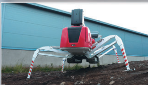
Levelling to the max. inclination 16°.